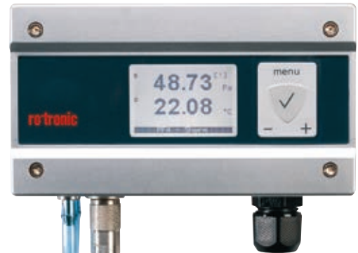
Pressure hose AC6001